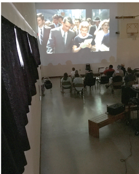
New curtains cover windows in the 10th Street gym so clients can better watch movies in Cinema Club.