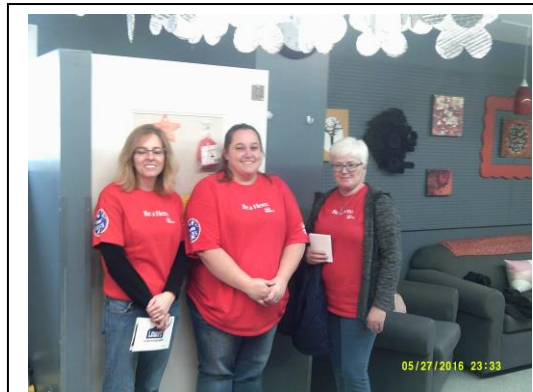
A Big Thank You to the Lowes Crew