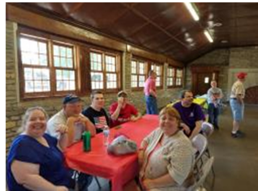
The employment crew at their picnic.