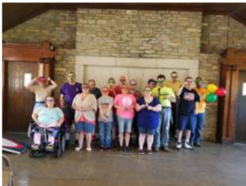
The working cew