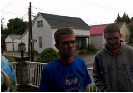
Waiting for the doors to open at the Museum in Salem