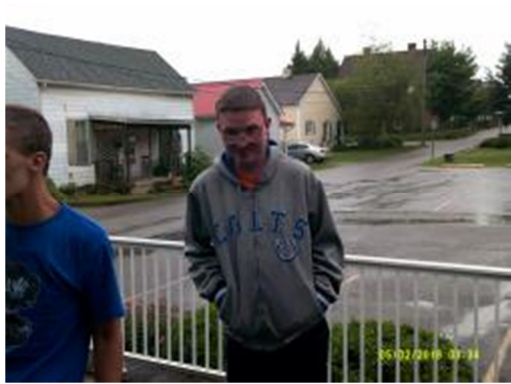
Outside of the Train Museum in Salem