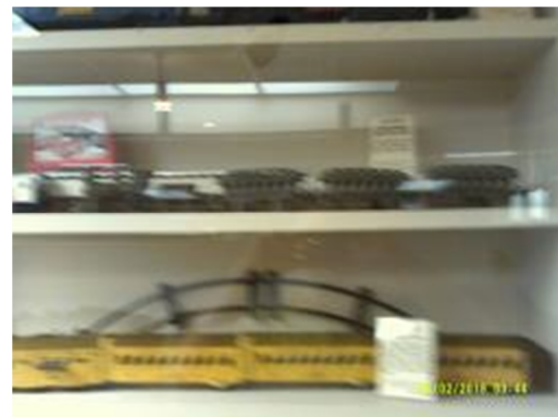
Very old train set