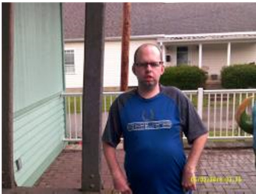
Ready to start the tour