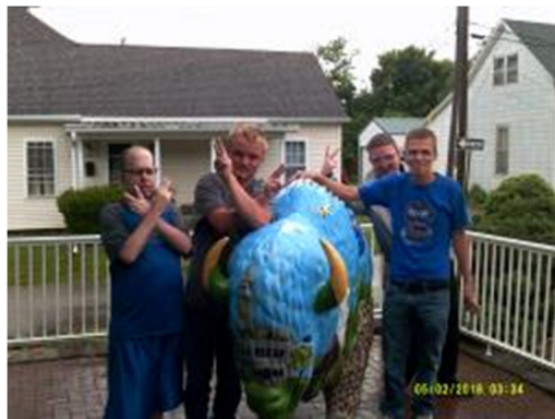
Stone buffalo outside of the Train Museum in Salem