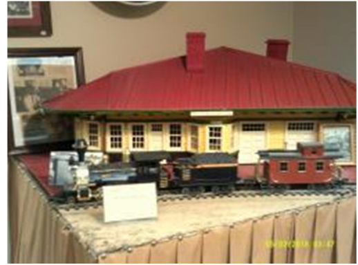
Replica of the original train station in Salem