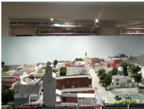
Salem in the sixties