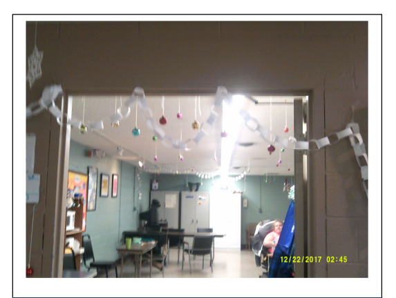
Some of the room decorations.