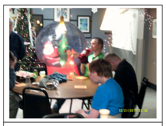
Bingo with the Knights of Columbus.