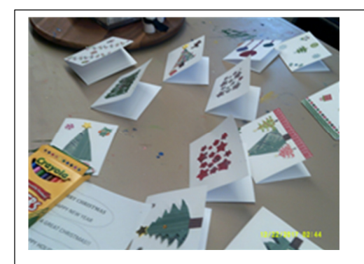
Christmas cards in the making.