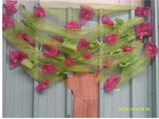
Some decorations in the shop room