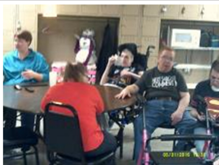
Ready to learn