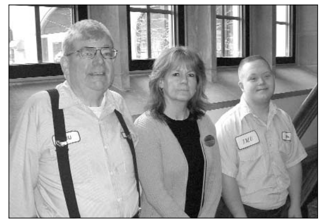
INDIANA MEMORIAL UNION HOUSEKEEPING & LAUNDRY

Representatives from the individual businesses accepted the award. Read on to find out about businesses that were honored.