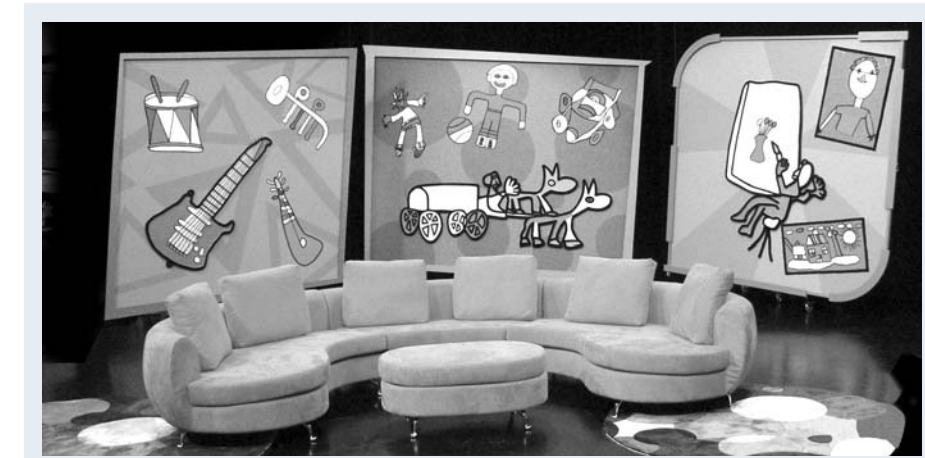
Panels from WTIU's The Friday Zone set depict six topics that children can learn about inside and outside of school: Indiana history, math, nature, performing arts, science and visual