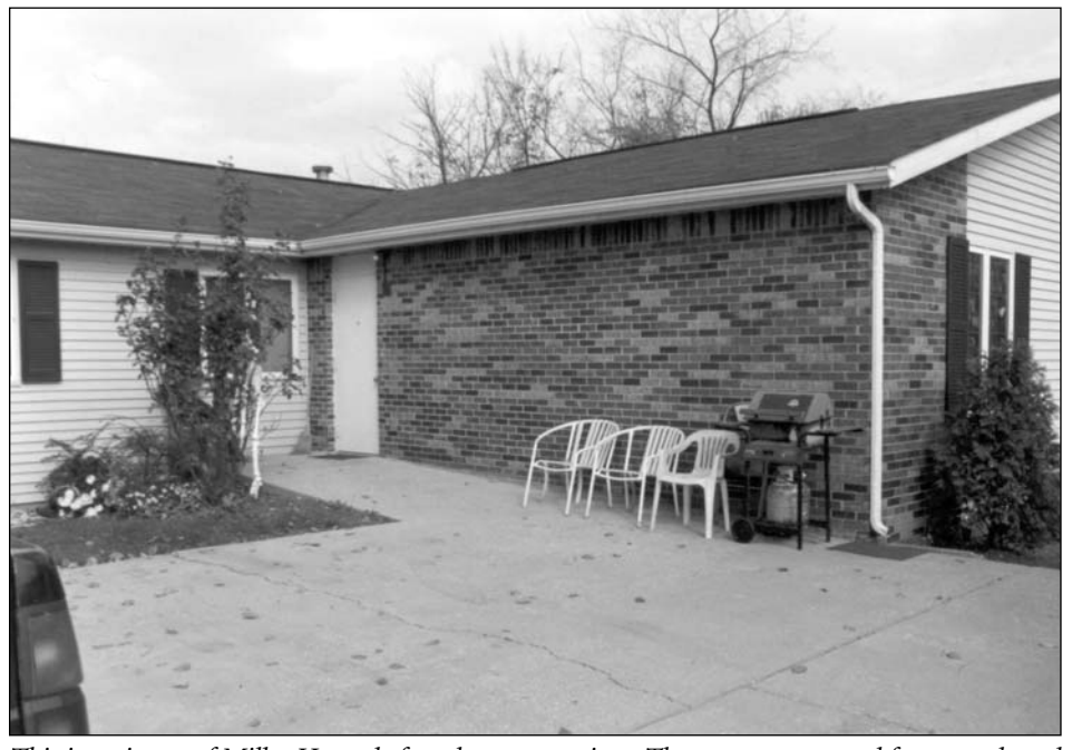
This is a picture of Miller House before the construction. There was no covered front porch and little landscaping at the front of the home. One of the reasons the porch was created was to give residents protection from the outside elements upon entering and leaving the home. Miller House opened September 11, 1987. It has seven co-ed residents.