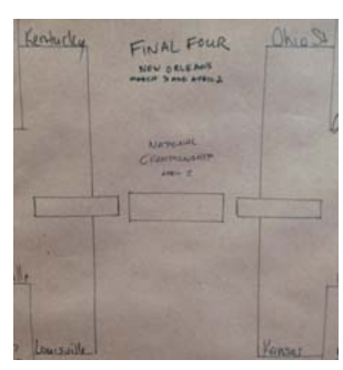
Who will it be?

The beginning of March may signify the end of another season of college basketball, but it also marks the beginning of the insanity known as March Madness, a tournament full of heavy favorites and Cinderella story underdogs going head to head to be crowned the national champions.