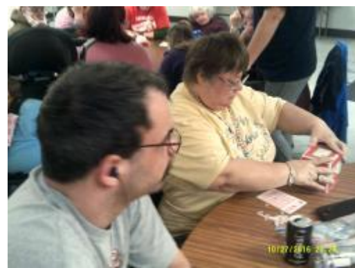
Bingo with the Knights of Columbus.