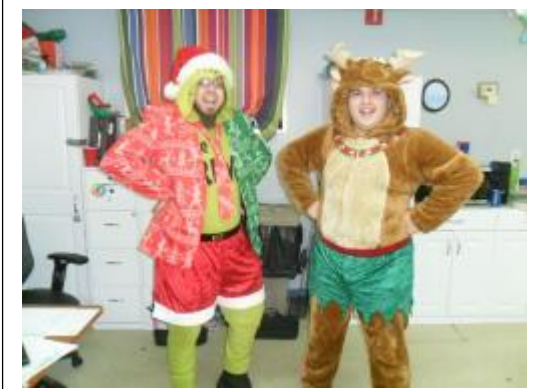
The Grinch and his trusty side kick.