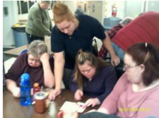
Playing bingo with the Knights of Columbus