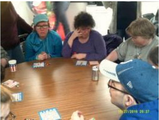
Bingo with the Knights of Columbus.