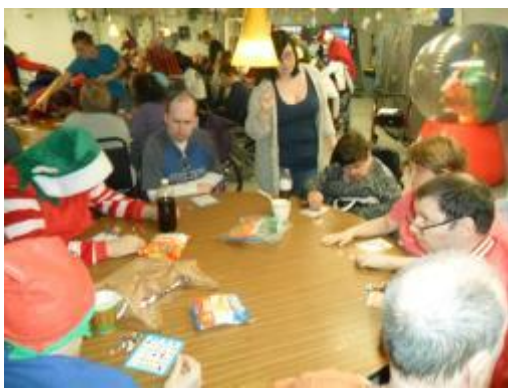
Bingo with the Knights of Columbus.