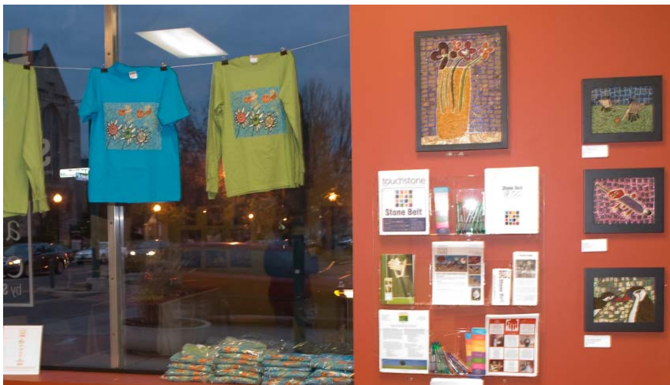
A dream became a reality in 2008, when Stone Belt Art & Craft opened a limited-engagement holiday gallery on the corner of Kirkwood and Washington Streets in downtown Bloomington. The gallery included original client artwork, as well as, products developed utilizing artwork and general information about Stone Belt.