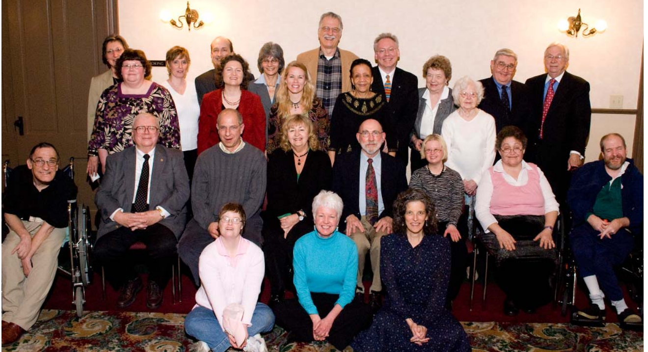
Stone Belt's 50th Anniversary celebrations started with a Leadership Appreciation Dinner held at the Fountain Square Ballroom in Bloomington. Past and present board members and directors attended the event.

Many more individuals will now have the opportunity to be employed in this cutting-edge field and Stone Belt will be able to enhance the work experience with contracts throughout the life sciences business community. The installation also creates increased opportunities for clients engaged in work in our Lawrence County facility.